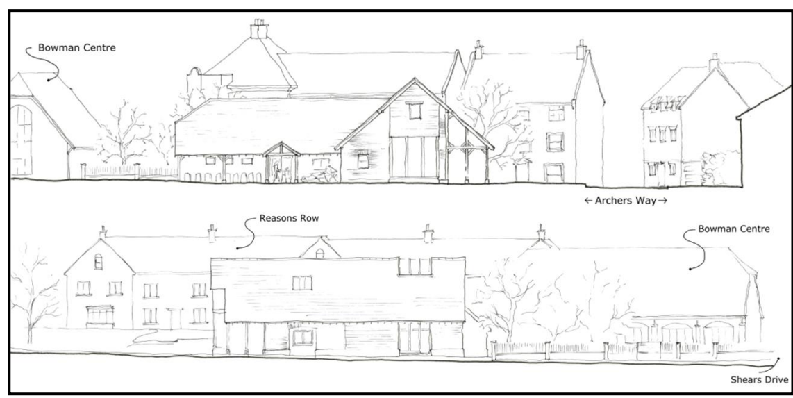
PLAN E: Context Street Scenes

As can be seen in PLAN D above and PLAN E below, the low slung eaves; the use of brick and timber boarding as well as slate and plain tiles; and the more simplistic roof forms and removal of the tower features all mean that the building will be less confrontational in the street scene and far more in keeping with the design and scale of existing, civic, vernacular of surrounding buildings. As a result of the lower eaves and smaller footprint, the overall bulk has also been reduced. It is also considered that the proposed design scheme is a vast improvement to the scheme approved in 2016 in terms of bulky forms and design detailing.