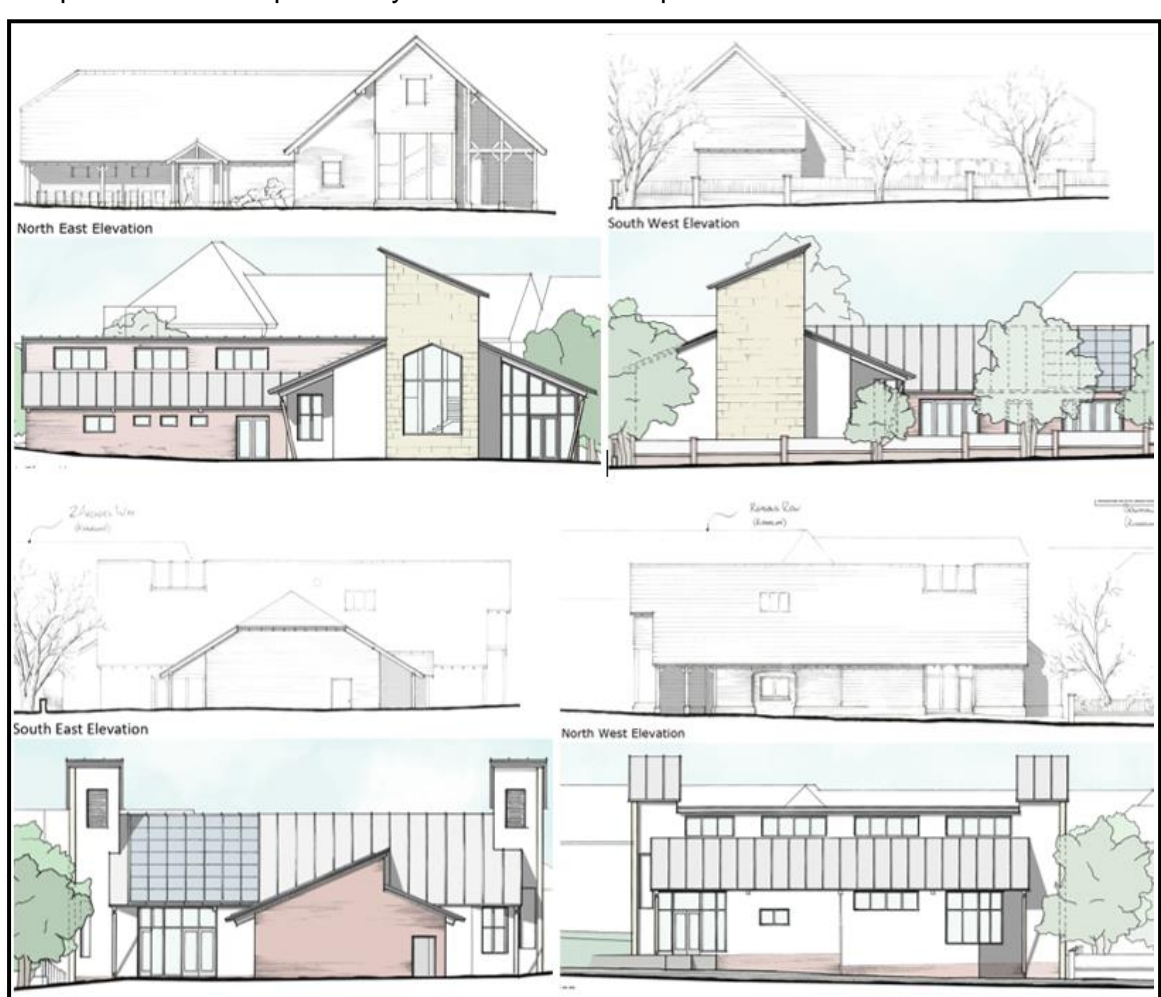
PLAN D: Comparative Elevations - Current Scheme vs 19/06605/FUL (Not To Scale)

The nursery element is to extend out from the principle church building at a right angle and will be of single storey form. It is to have a cropped hip gable roof form with significant eave overhang on its front and rear elevations. The supporting documentation confirms that since the previous scheme was refused, the design has evolved and 'this proposal seeks to tone down the focal point element and appear more as a community building and follow a more vernacular route of the surrounding community buildings' and 'The overall mass...and bulk of the building has been reduced, with the eaves line down to ground floor level resembling the similarly 'low slung' public buildings within the vicinity'. The detail of the more barn like design and a comparison with the previously refused scheme is provided in PLAN D below.