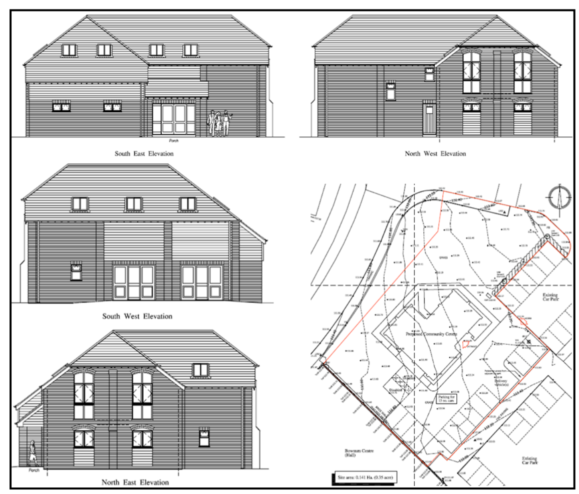
PLAN B: Approved Plans for 16/02899/FUL on Parcel D

Whilst this permission has since expired it does establish the principle of the site's redevelopemmt with a new church and nursery facility.